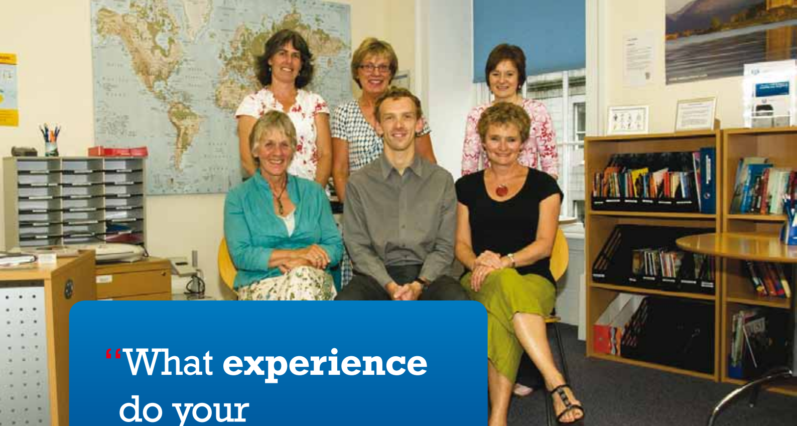
Our senior teaching staff.

“What experience do your teachers have?”